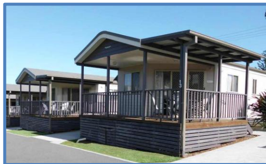
Deluxe Seabreeze Cabins